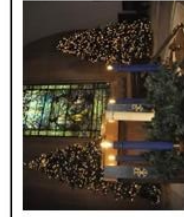
The congregation was highlighted in the local news paper in a feature called, The True Meaning of Christmas

We have had the privilege of having the New Year's Eve Party for the entire congregation at our home every year. This year was exceptionally special as people came at 6 and spent a wonderful night in fellowship and food. At 11:50pm the service was started, scripture read, short message and the first verse of Let Us Break Bread Together , was sung. At 11:57 the bread was broken together, passed and eaten. The Clock struck midnight. We sang the second verse - Let us Drink Wine Together . The wine portion of the sacrament was passed and drank at 12:02am. We saw 2011 go out with the Body of Christ joining together in one of the most sacred traditions, the new covenant between Christ and his church. The first thing in 2012 was together looking forward to the dawning of a new year being cleansed of our sins as we partook of the cup of Christ and the blood that was shed for all. It was a very moving experience and really brought our small congregation together in such a close way, it is hard to describe or put into words. But it is an experience that will NOT soon be forgotten!